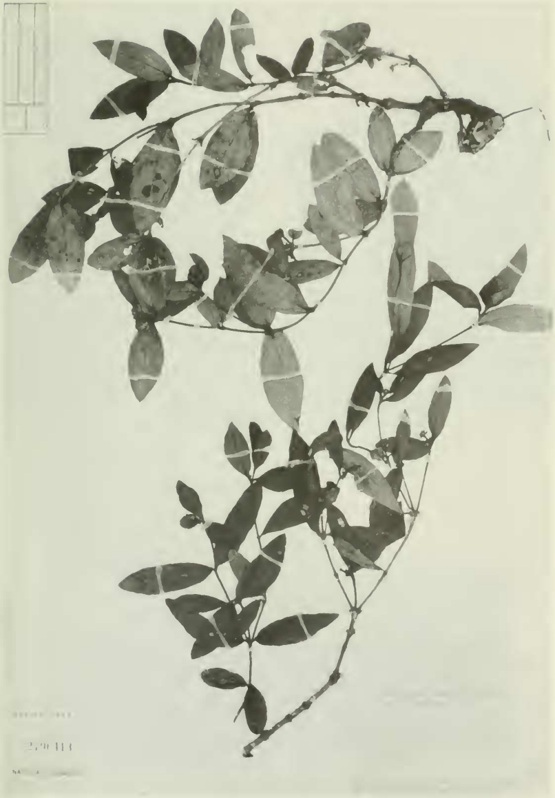
Ichthyothere elliptica H. Robinson, Isotype, United States National Herbarium.